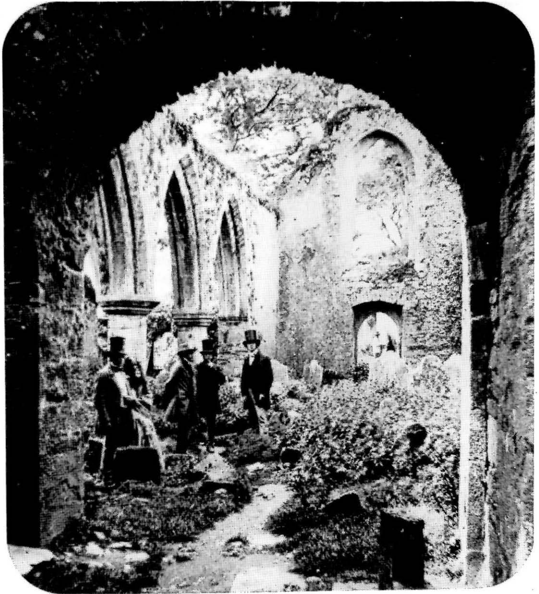
ANTIQUARIES OF THE 1860s AT KILCREA