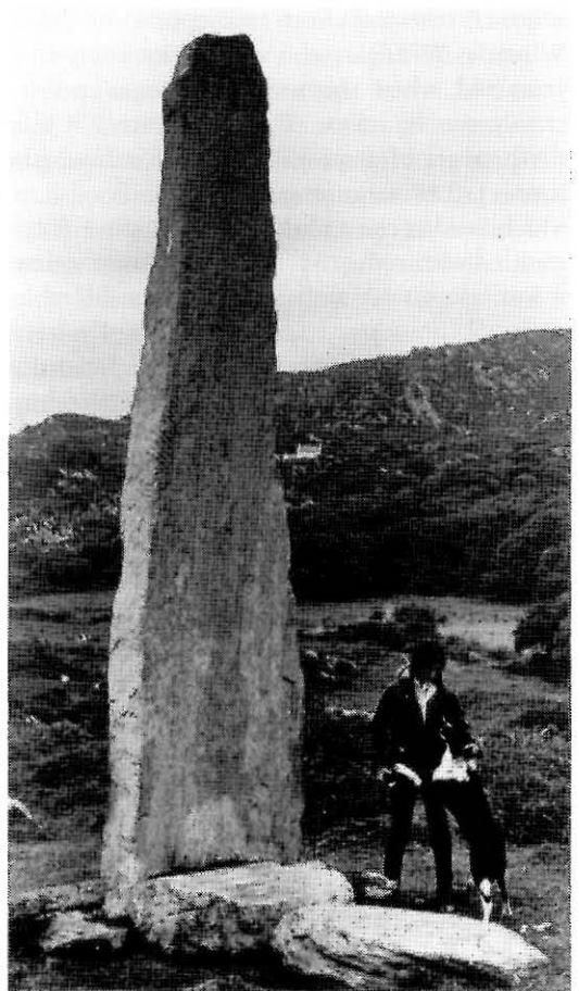
OGHAM STONE AT BALLYCROVANE (1976)