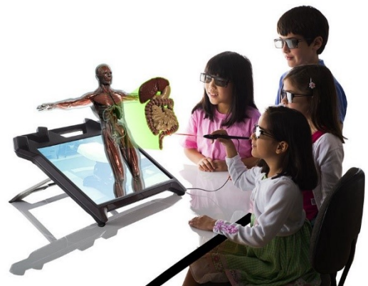
Fig. 1. The use of VR to manipulate objects in a virtual world [6]

VR is transforming education and learning by reshaping the taught process into an interactive experience embodied in the objects of the virtual environment [3]. According to Chen et al. [4], VR offers various capabilities that can provide promising support for education. Some of these capabilities include the ability to allow the learners to experience, manipulate, and articulate their understanding of the virtual environment in real-time, interact with 3D virtual representation, and visualize abstract concepts and the dynamic relationships between several variables in the virtual environment. The system also allows individuals to collaborate with each other in a virtual environment as well as to visit and interact with events that are unavailable or unfeasible due to barriers such as distance, time, cost, or safety factors. With VR headset students can explore 3D spaces and experience dangerous, expensive or inaccessible places and events. VR can be utilized to simulate emergencies, witness volcanic activity from close-by, to walk through ancient cities, and fly through the solar system. Those studying Architecture can evaluate their buildings in new ways, pilots training can be simulated, power engineering students can simulate surge and how to control it in electric power systems, and medical students can learn about the body in 3D as shown Fig. 1 [5].