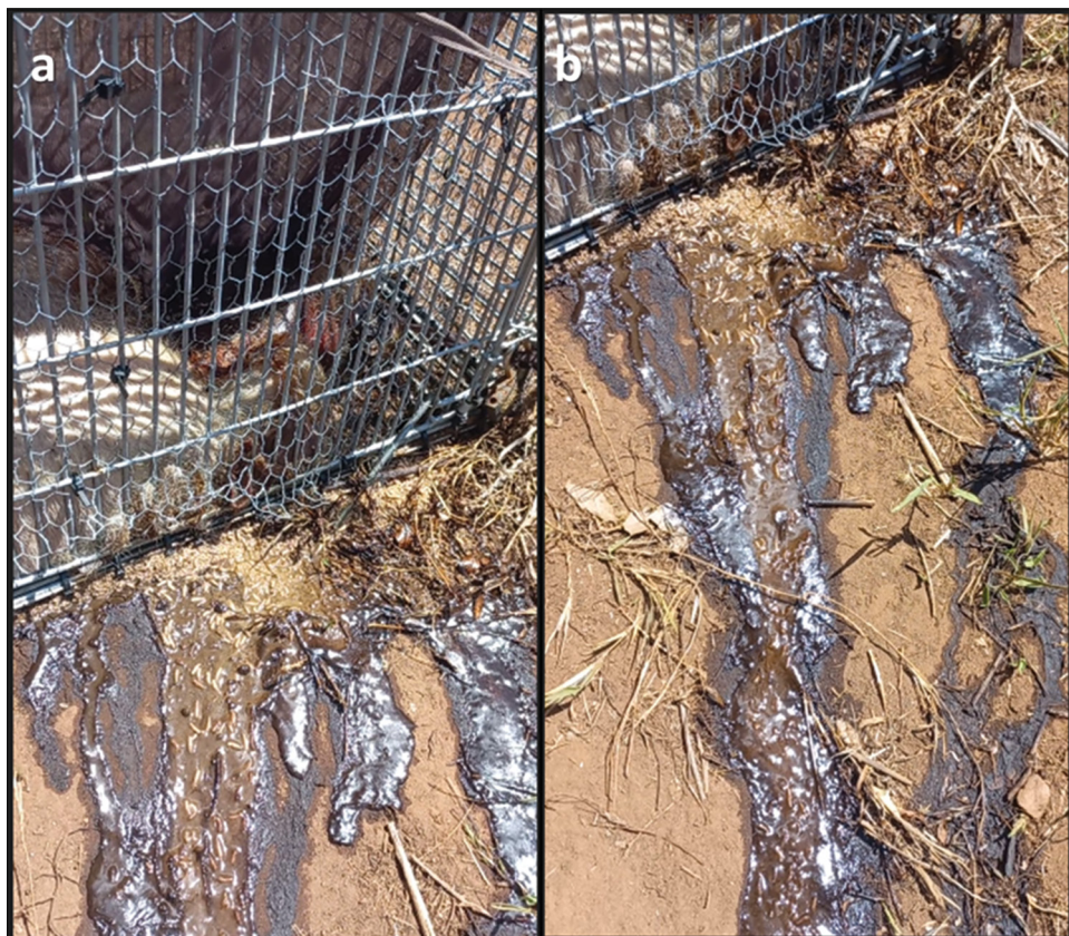
Figure 2: Close-up views of some larvae (a) at the starting point and (b) further down the stream of the decomposition fluids oozing out from the pig carcass.