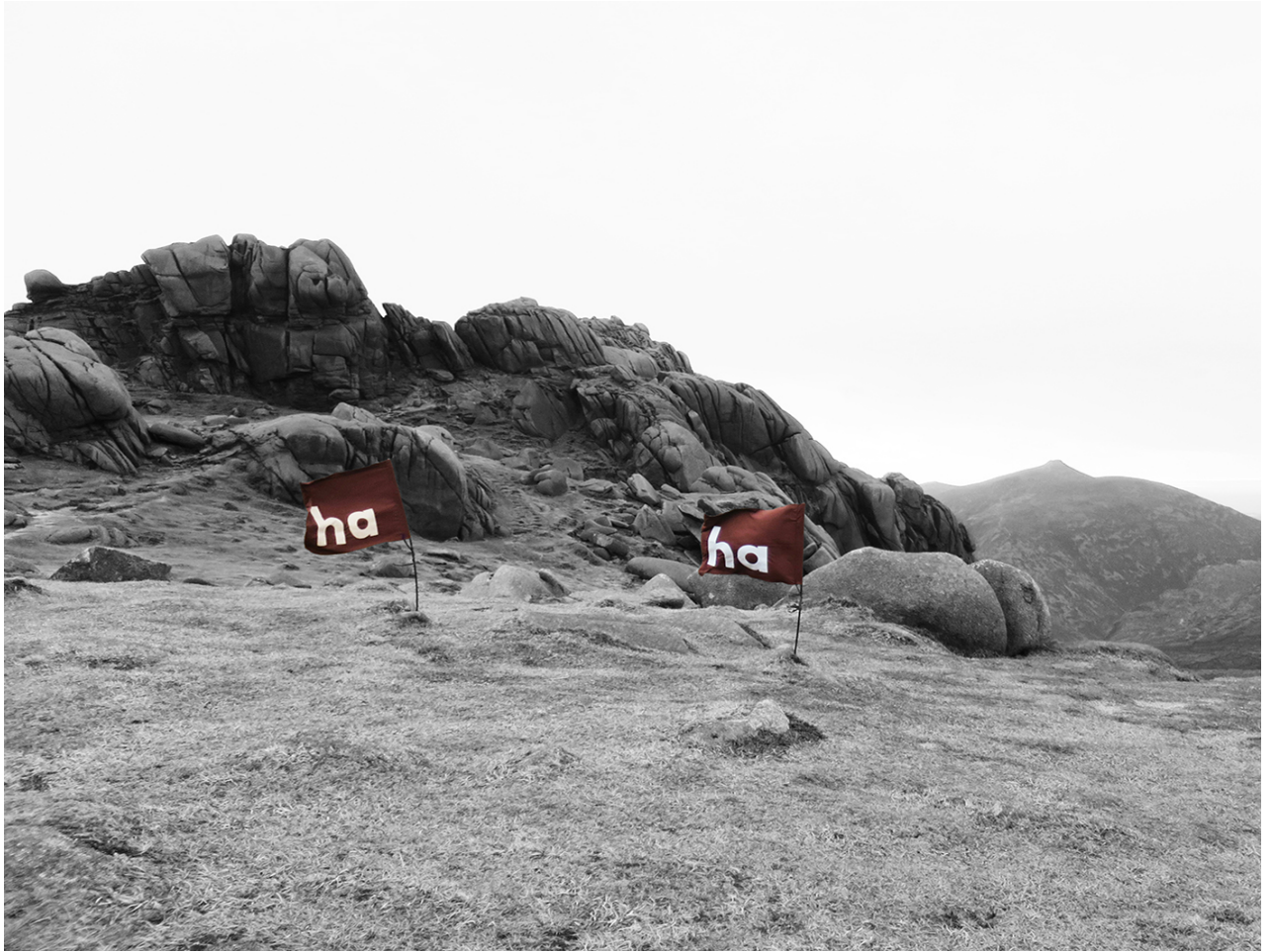
Summit Stammer - Bearnagh (ha ha Syzygetic experiments)

Summit Stammer - Bearnagh. Flags, poles and photographs Dan Shipsides 2023