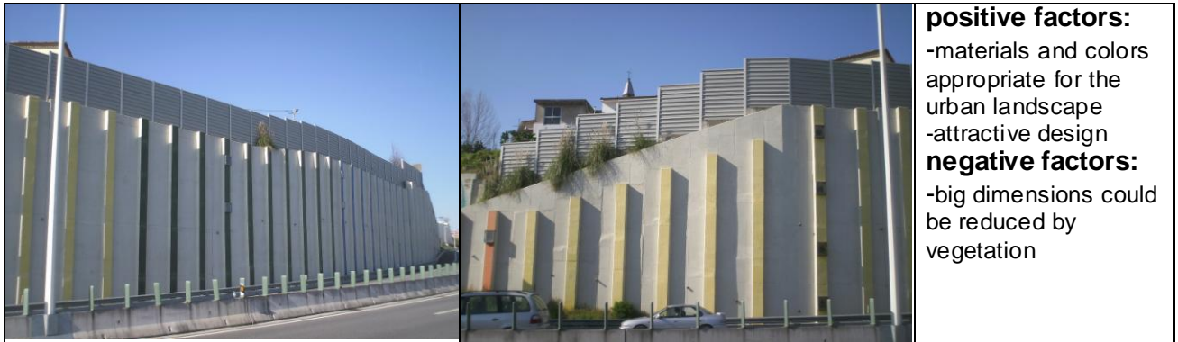
Figure 4 – Example of a barrier along the A43-IC29