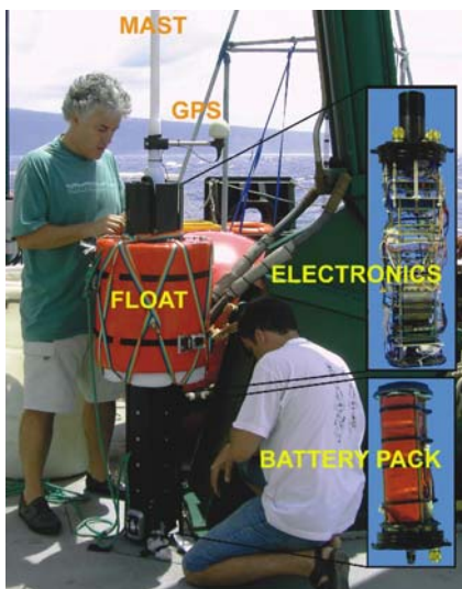
Figure 1: "AOB pre-deployment setup, during Makai Ex. sea trial"

The physical characteristics of the AOB, in terms of height (1.2m), diameter (16cm), weight (40kg) and autonomy (12 hours) tend to those of a standard sonobuoy. However, the AOB presents advanced capabilities, which include: stand-alone or network operation; local data storage; dedicated signal-processing; GPS timing and localization; real-time data transmission and relaying. In this section the AOB hardware and software is briefly presented and the main characteristics of the 'base station', an air RaN node, will be given.