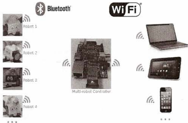
Fig. 1. Architecture of the educational robotics system, composed of Infante robots, a multi-robot controller, a web-based programming interface that can be accessed by any device with a Wi-Fi connection, and a Javascript-enabled web browser

The system that is going to be presented in this section was designed to be extremely simple to use and fast to set up. When it was designed we had two major criteria in mind: if it cannot be set up in under five minutes, it will not be suitable for teachers, and if it cannot be explained to children in under five minutes, it will not be suitable for kids. Also, the system has been designed to have an extremely low cost. The system is composed of five robots which were named “Infantes” and a single multi-robot controller. This architecture (see Fig. 1) allows the robots to be built with simple and cheap components, while maintaining the usability of a web-based graphical programming interface through a Wi-Fi connection. This architecture also makes the system extremely easy to use at science fairs and exhibitions, allowing visitors to interact with the robots with their own smartphones or tablets.