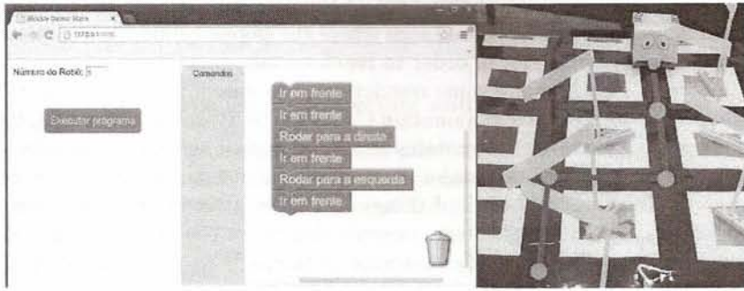
Fig. 4. Example of the programming interface based on Blockly and how the instructions translate into real robot actions. The interface is in Portuguese, since it was used with Portuguese children.

This limitation of the instructions was adopted to make it suitable for the young children who would participate in the experiments that we planned to conduct. We also enabled Blockly to interact with real devices, the Infante robots, by using a Python web server based on the Tornado framework, as previously mentioned. Apart from these modifications, we also added a simple input box to the interface in order to select the number of the robot to be programmed.