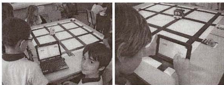
Fig. 6. Third graders using the robots. Left: pupils use a laptop to control the robot in carrying the lamp to the proper recycling bin. Right, a pupil uses a tablet to program the robot while others analyse the solution and say which commands to put in the programming sequence.