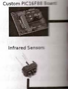
Fig. 2. Infante

market. The custom board has good documentation support and easier to assemble. For line following and obstacle sensors ( 0.15\text{€} each), and for an HC-05 Bluetooth module ( 0.50\text{€} ) could find. For the structure of the materials like expanded PVC and the building materials and sensors, each robot cost about 15\text{€} , and to put the first one together and tested, the others were assembled require 4 AAA batteries.