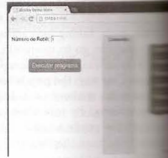
Fig. 4. Example of the programming interface. The programming actions translate into real robot actions with Portuguese children.

The programming interface is based on Blockly [2], a google project that allows one to make short programs by dragging and dropping programming blocks to interact with virtual objects on the computer screen. It is similar to Scratch, but works in a web-browser. Since Blockly is an open-source project, we adapted it to contain only three basic operations: go forward, rotate 90° to the left, and rotate 90° to the right (see Fig. 4).