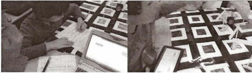
Fig. 5. 4th graders using the robots. Left: one pupil explains the programming sequences while another uses a computer to program the robot. Right: pupils use a tablet computer to program the robots.

Having the development of this kind of thinking and reasoning in mind, we designed an activity with several tasks where the pupils would have to plan the paths of a robot, on a grid, in order to reach certain goals, taking into account that in some tasks there are some restrictions. For example: go to mountain A, pass by mountain B but avoid mountain C. This activity also includes geography, since the goals were always mountains from Portugal. This way, the pupils learn the relative positions of the major Portuguese mountains without even being aware of it. Teaching this kind of things is usually achieved by repetition and memorisation. By using the robots we were able to get the pupils actually interested and motivated to learn the locations by themselves, since they wanted the robot to complete all the tasks.