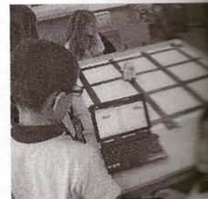
Fig. 6. Third graders using the robots carrying the lamp to the proper position while others analyse the programming sequence.

In the activity that we describe the ease with which 4th graders further to test the system with Fig. 6). The activity was similar them aware of recycling and see given to groups of 5 to 6 pupils were placed in the robot's naviga also placed in the grid. The task that was then placed on top of We left them again to work on the previous activity, the pupils regardless of the programming problems occurred: not making the same place, confusing left w of view of the robot. However, we were working as a group, tryin other why they thought the robot could fix it. Once more, the pup tasks rapidly and then invente robots until the class ended.