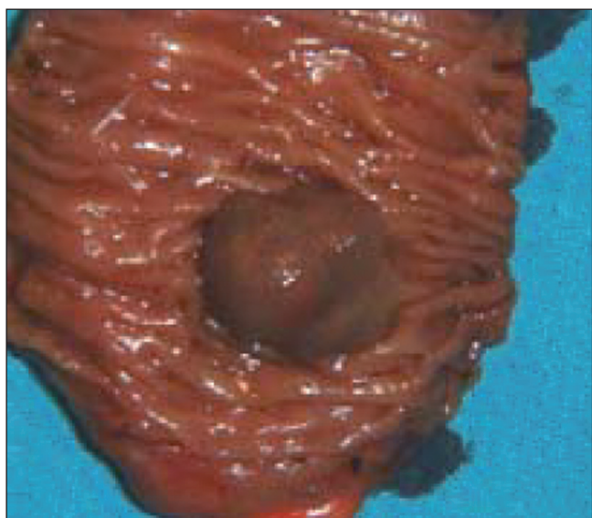
Fig. 5. Surgical specimen: one cavernous hemangioma at the ileon.

jejunal varices (n = 1). In 4 (21%) patients no small bowel lesion was identified, however a colonic diverticular bleeding, a duodenal angiodysplasia and a duodenal ulcer were detected under IOE and assumed as the source of the bleeding (Table III).