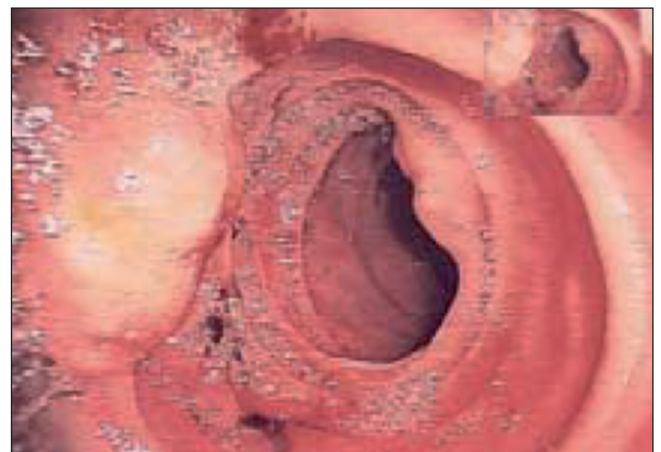
Fig. 2. Intraoperative enteroscopy: two cavernous hemangiomas at the jejunum.