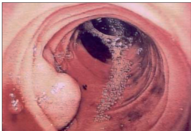
Fig. 3. Intraoperative enteroscopy: one cavernous hemangioma at the ileon.