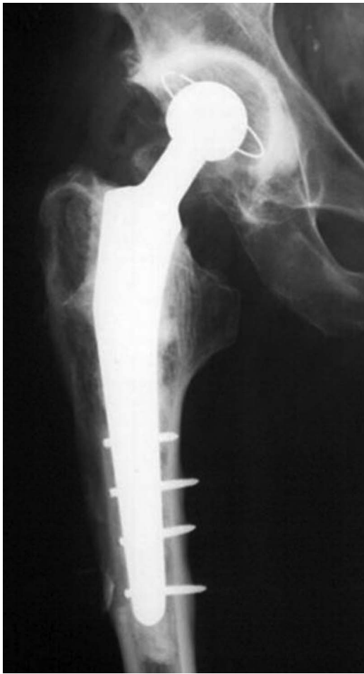
Figure 3 Postoperatively anteroposterior total hip arthroplasty radiograph at follow-up period of 6 months. The implant was stable with a satisfactory position, and it was possible to observe a bone remodelling process in the lateral femoral cortex.

removal of the osteotomy hardware and implantation of a cemented THA. The heads of the screws, the nail and the plate were removed, and after the cut of the femoral neck, the permeability of the femoral canal was explored. The screw threaded portions were retained because they did not interfere with the cementation of the femoral stem.