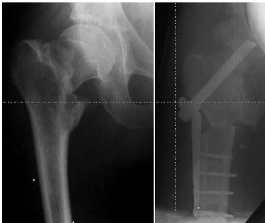
Figure 1 Traumatic fracture of right femoral neck, in 1958. Femoral valgus osteotomy and osteosynthesis with a MacLaughlin plate and a Smith Peterson nail.

hospitalisation period. At 1 month postoperatively the patient was clinically able to walk without external support.