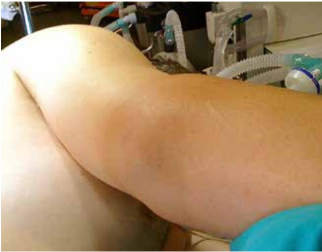
Figure 1 – Warm swelling in the right shoulder and arm.