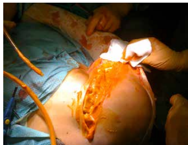
Figure 4 – Washing with physiologic saline solution and povidone-iodine.