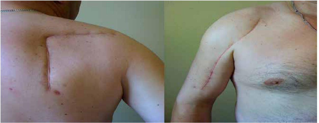
Figure 5 – Slightly hypertrophic surgical scars.

a cause of NF. The puncture itself and the possible interference of steroids with leucocyte function can cause soft tissue infection. DM may also be a predisposing condition because of associated microvasculature and immune system changes, that allow rapid progression of infection, and peripheral sensory neuropathy that increases susceptibility to trauma and delays presentation of patients to medical examination. 9