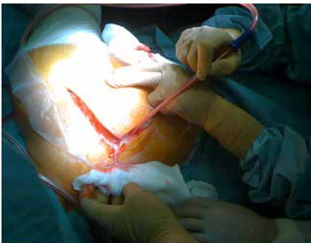
Figure 3 – Extensive collections of purulent content drained (posterior approach of scapula).

According to Fanfarillo et al's 2011 review, intra-articular steroid injections are very rarely reported in the literature as