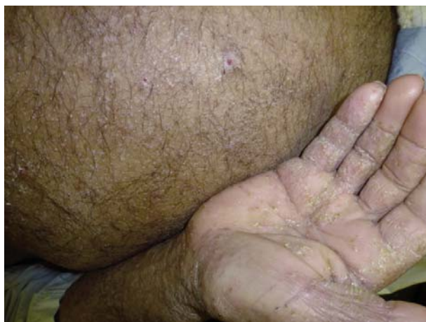
FIGURE 1: Burrows and honey-colored crusting in the palms with marked scaling and scratching lesions in the abdomen