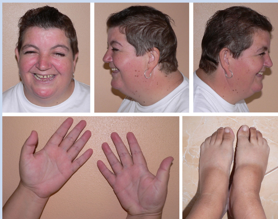
FIG. 3. Middle sister at 43 years of age. Note the resemblance in facial features to those in her sister. In addition she shows a grimacing smile. Hands and feet are normal.

less obvious facial signs (Fig. 1). This may indicate that these signs may not be related to the entity in the sisters. If these features are part of this syndrome (i.e., associated with the intellectual disability and the hands anomalies), one may argue that if this is an autosomal recessive entity, these features may represent manifestations in a heterozygote, and if this is an autosomal dominant entity, it might mean that the phenotype can vary widely also with respect to cognition. We also hypothesized that this condition could be X-linked and its intra-familial variability explained by lyonization differences. The X-chromosome inactivation studies performed did not support this hypothesis however.