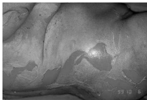
FIGURE 27.5 Extensive skin detachment in a patient with toxic epidermal necrolysis from allopurinol.