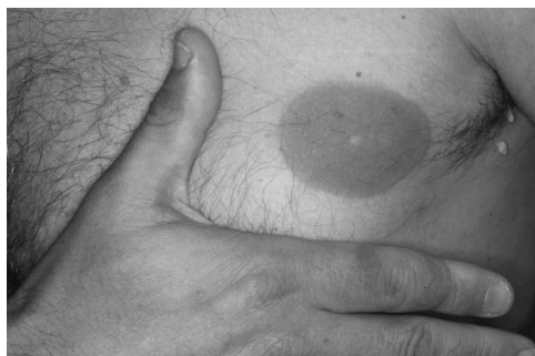
FIGURE 27.6 Typical round erythematous-violaceous lesions in fixed drug eruption from piroxicam.

At the acute phase there is a mononuclear inflammatory infiltrate, mainly at the dermal epidermal junction, with