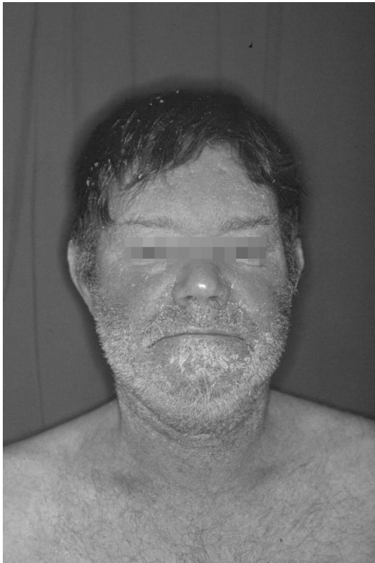
FIGURE 27.3 Exfoliative dermatitis with facial edema in a case of DRESS induced by allopurinol.

apparently independent of drug metabolism and antigen processing. 15 These T cells have a \alpha\beta TCR, almost all with the V \beta 5.1 chain, suggesting that the drug might also act as a superantigen. 55 These T-cell clones are rich in perforin and secrete a type 1 cytokine pattern with IFN- \gamma and chemokines that control the duration and severity of the inflammatory response, 15 but they also show a very significant IL-5 secretion which is responsible for the characteristic eosinophilia observed in this syndrome. 56