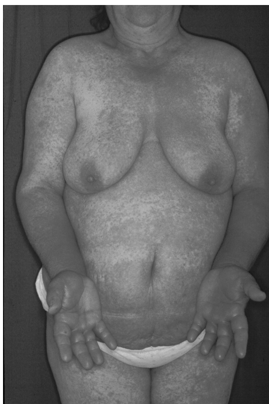
FIGURE 27.2 Maculopapular exanthem from carbamazepine.

grade fever which can also contribute to mimic a viral or bacterial exanthem. The reaction develops within 7–14 days after drug intake (or within 1 or 2 days in sensitized patients) mainly due to antibiotics (aminopenicillins, cephalosporins, and sulfonamides), allopurinol, and anticonvulsivants. The reaction may be mild and regress within a few days, but most often it progresses for a few days even after drug suspension and then fades progressively within 10–15 days, often with desquamation. 5,51 (Figure 27.2 showing a MPE from carbamazepine.)