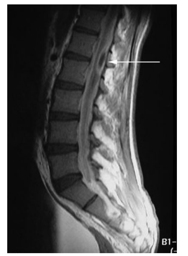
FIGURE 2. Sagittal T1-weighted sequence of the lumbar spine reveals a hypointense lesion at the posterior epidural space (arrow).

thickening of the ileum and a fistula between the small bowel and the abdominal wall were clearly visible at abdominal CT scan. Magnetic resonance imaging (MRI) revealed a complex perianal suprasphincteric fistula with a posterior direction, ending on a presacral and precoccygeal abscess (Fig. 1) with periradicular leptomeningeal infiltration. MRI also revealed a second epidural abscess at the level of L1-L2 (Fig. 2).