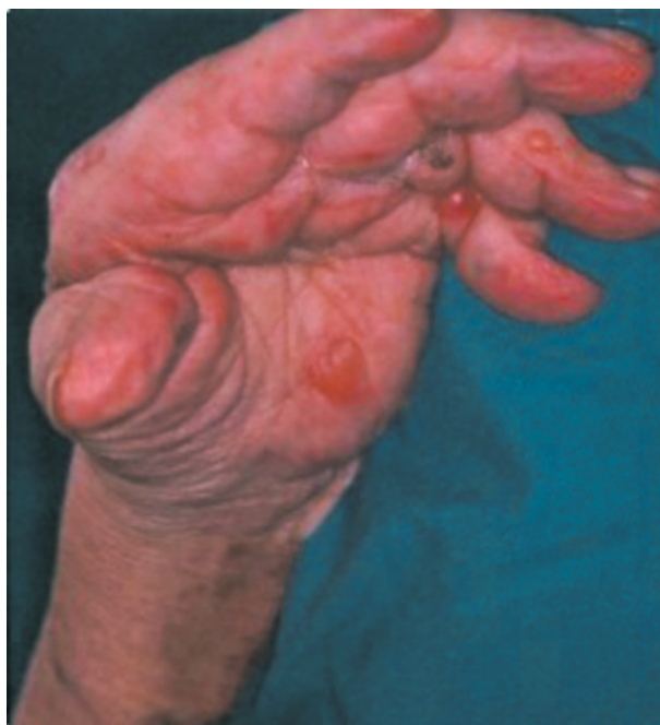
Figure 1 Hand with tense bullae within erythematous plaques