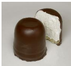
Figure 4: Negerkuss 12

technique of description, the translator can intervene and draw the text closer to the target reader.