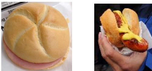
Figure 6: Wurstsemmel 15 vs. bocadillo de salchicha 16

Lastly, we find that techniques are sometimes combined. This is the case of the Austrian Wurstsemmel (‘roll with cold cuts’), translated as bocadillo de salchicha (‘sausage sandwich’). This might sound like a description or literal translation, especially taking into account the polysemy of Wurst (‘cold cuts’ or ‘bologna’ vs. ‘sausage’), but it actually describes a slightly different concept that also belongs to the source culture, the typical German sausage roll. This is why this translation has been classified as a combination of description and intracultural adaptation.