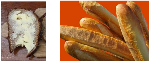
Figure 3: Butterbrot 10 vs. pan 11

Example: The German expression Butterbrot ('buttered bread'), a very simple traditional evening or take-along meal, is rendered in Spanish as pan ('bread'). Apart from the prototypical Brot being quite unlike pan , the translation disregards all additional connotations (and the butter, of course) and lifts the concept to a more general level.