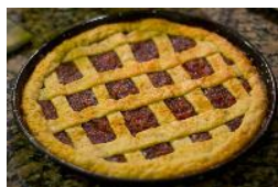
Figure 5: Spekulatius 13 vs. pasta de pastaflora 14