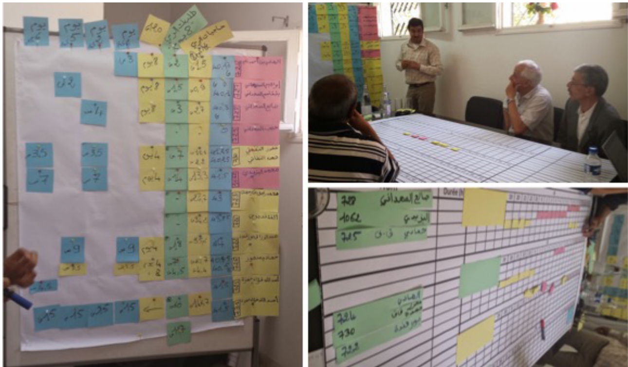
Figure 3. Photos of farmers and WUA discussing new irrigation management rules.

The access to groundwater resources and the irrigation technique were considered in this process. Each farmer indicated his desired duration and frequency of irrigation (Fig. 3).