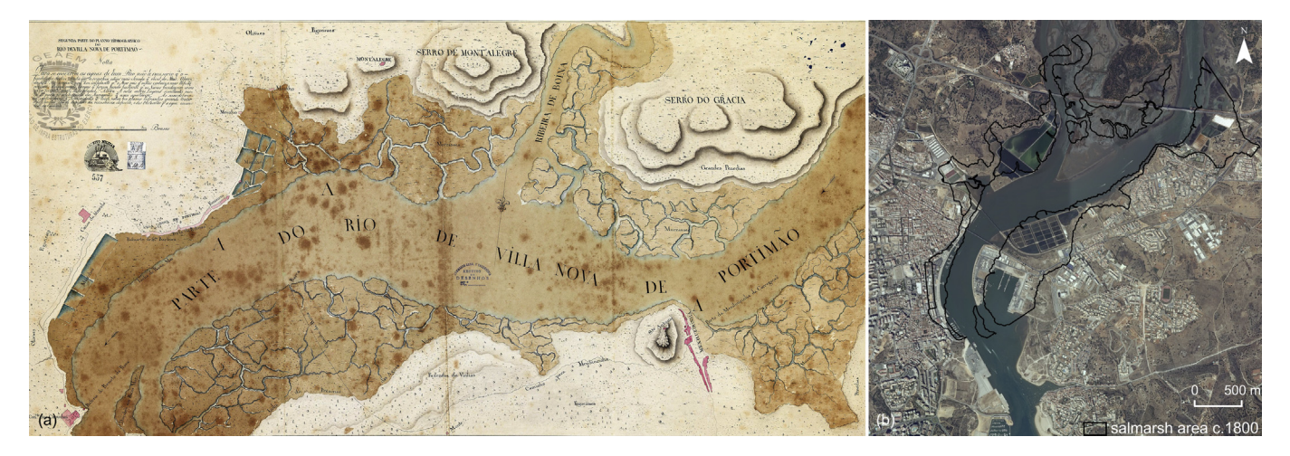
Fig. 2. a) Arade River and surroundings in c. 1800 (Baltazar de Azevedo Coutinho, Geographic Military Institute-IGEOe), b) saltmarshes of Arade River in c. 1800 over ortophotomap of 2010.

Floristic surveys were conducted in the following dates: 15–18 October 2012 (Alvor); 7–10 February 2013 (Arade); 23–25 March 2013 and 20–26 April 2013 (Alvor and Arade). Floristic surveys