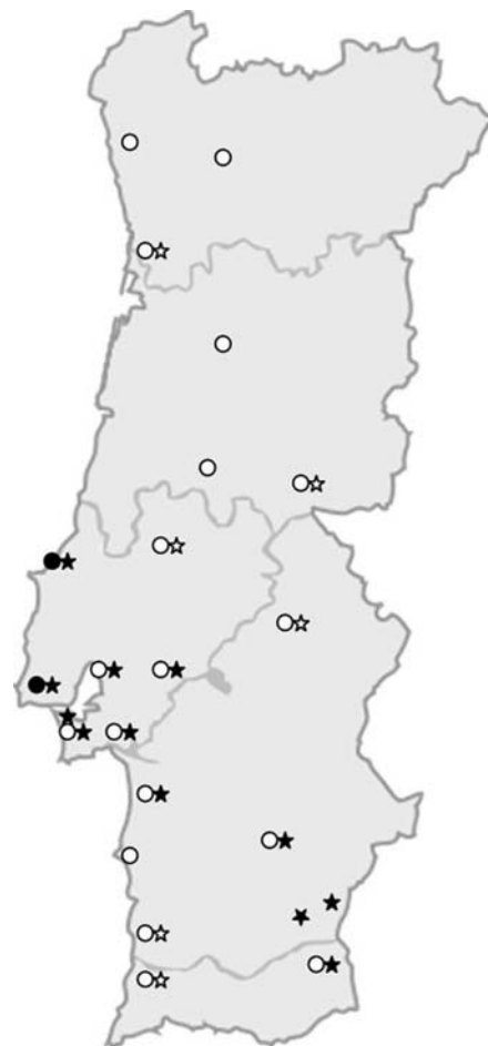
Fig. 1 Distribution of Ophelimus maskelli in Portugal in 2007, based on the presence of typical leaf galls in two Eucalyptus species: (closed stars) E. camaldulensis with galls; (open stars) E. camaldulensis with no signs of galls; (closed dots) E. globulus with galls; (open dots) E. globulus with no signs of galls

The susceptibility of the two Eucalyptus species to O. maskelli was evaluated also based on gall size. A sample of 30 galls per each tree species was collected from different leaves and their diameter was measured. Differences between plant species were compared by using a t -test on untransformed data.