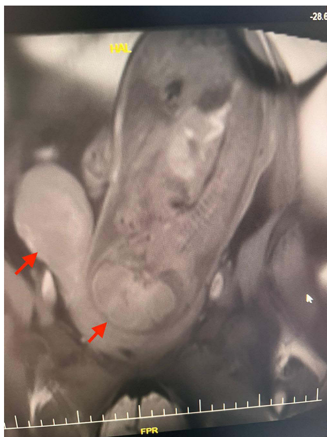
Figure 2 Magnetic resonance image showing two adjacent noncommunicating uteri (arrows), one of which is empty and the other is bearing a fetus.