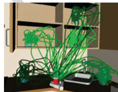
Figure 2. A subset of the possible end-effectors path for a shared control assistive arm in daily life activities. Please provide the high-resolution image as this will not print well. >

devices (shown in Figure 3). Please check whether the preceding edited sentence retains the intended meaning. A prerequisite to the performance comparison of intelligent systems is the ability to replicate research results; however, this is still difficult in many if not most cases.