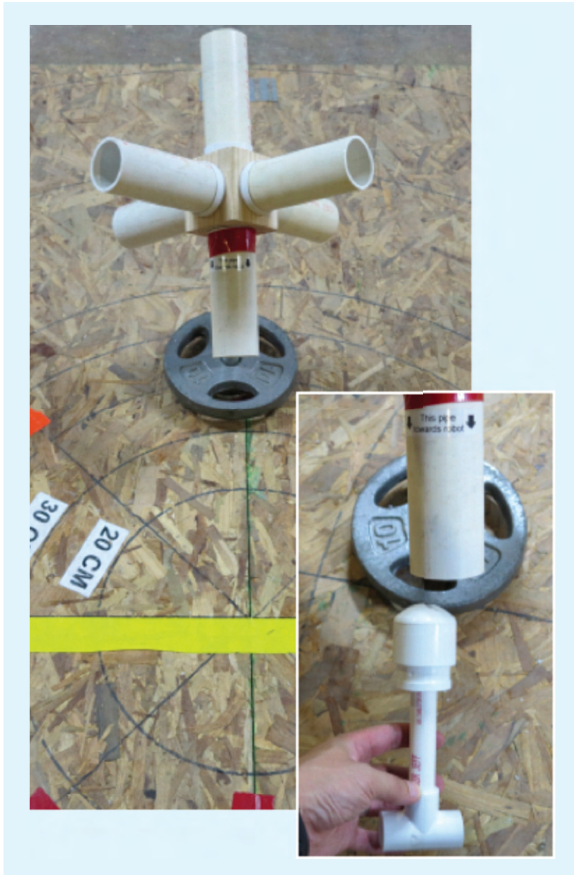
Figure 3. The nodal apparatus for a manipulator dexterity evaluation. This model has six directed inspection targets and can be used for retrieval and insertion evaluation as well. <AU: Please provide a high-resolution image as this will not print well. >

The Technical Committee on Performance Evaluation and Benchmarking of Robotic and Automation Systems (TC-PEBRAS) is intended to serve as a forum to address performance evaluation and benchmarking issues pertaining to robotic and automation systems. This means it is active on both the scientific and methodological challenges, hindering the design and the sharing of mature and usable