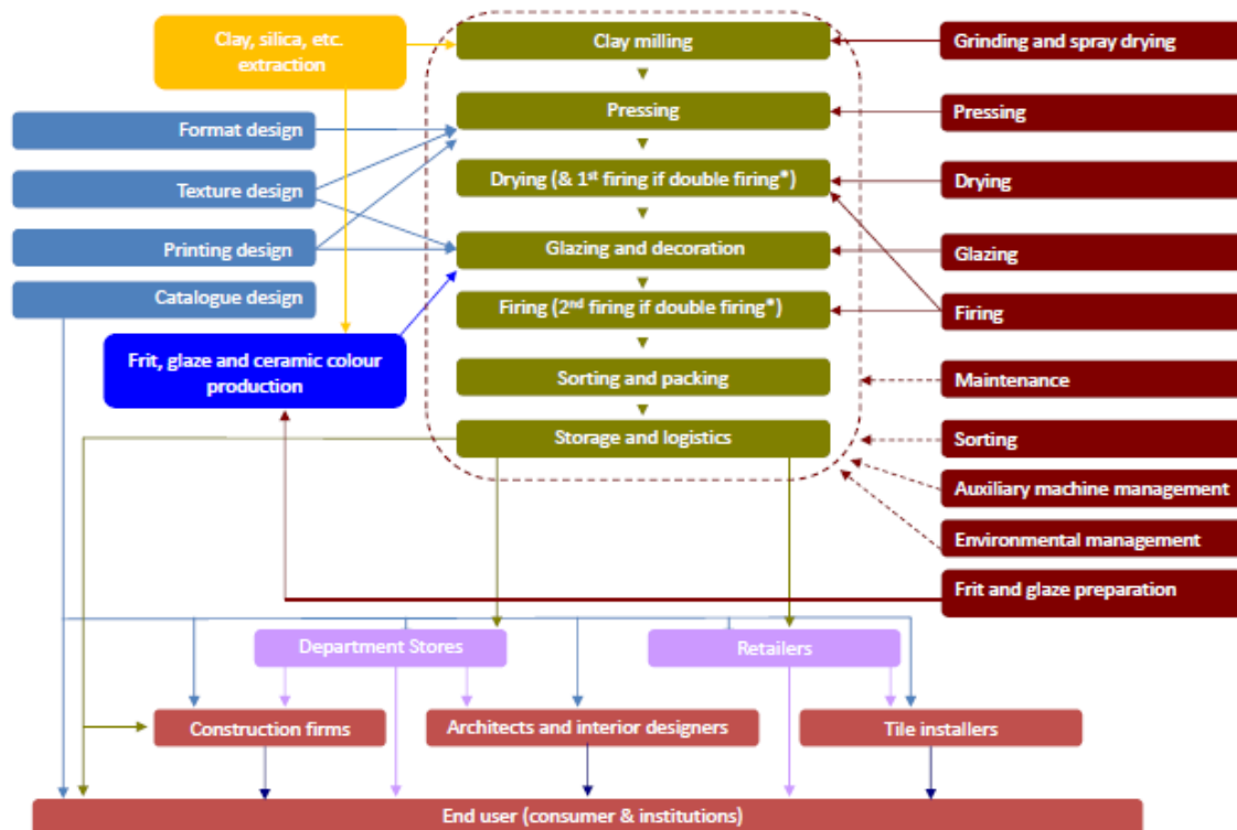
Figure 1: Central elements in the ceramic tile production process

Figure 1 depicts the six main elements of the ceramic tile production process. We provide a descriptive analysis of these elements and measure their contribution to the value chain.