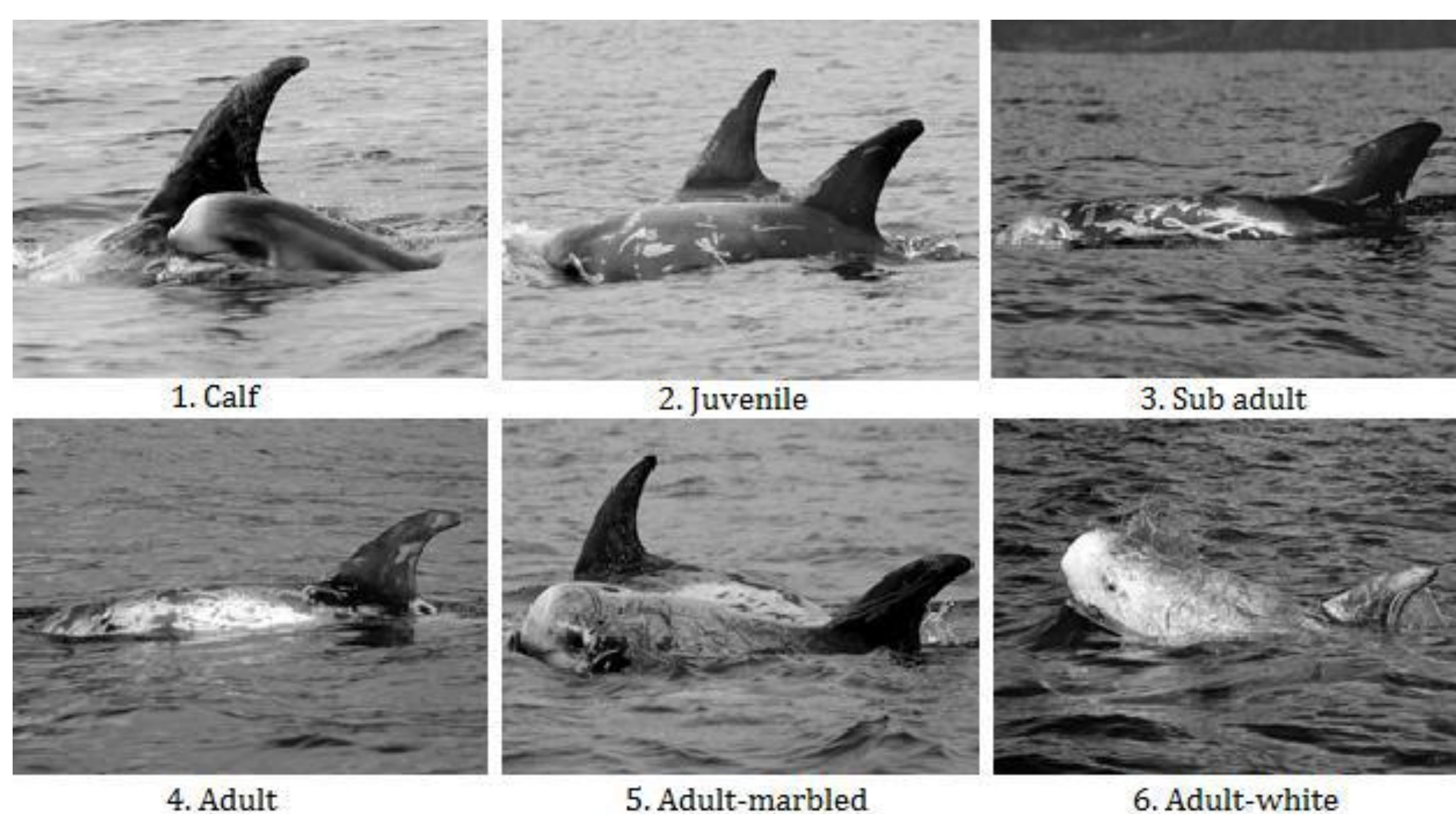
Figure 1. The six Risso's age classes differentiated in this study

We tested six assumptions 6 found under this model (see Results). MARK computes the estimates of model parameters via numerical maximum likelihood techniques.