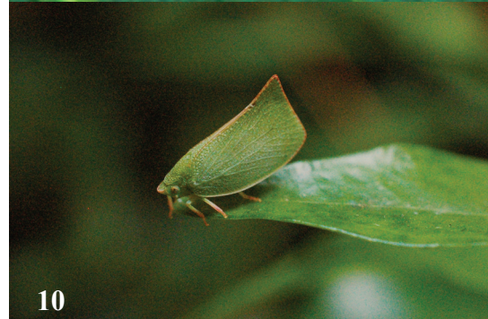
Fig. 8 (above) The stick insect Carausius morosus (Photo: Paulo A.V. Borges); Fig. 9 (intermediate) The leafhopper Cicadella viridis (Photo: Nuno Bicudo da Ponte); Fig. 10 (below) The planthopper Siphanta acuta (Photo: Nuno Bicudo da Ponte)

Cicadella viridis is a polyphagous Holarctic leafhopper widespread in the Old World including Europe (Young 1977). It prefers wet areas, feeding on grassy plants (e.g., Phragmites , Arundo and Juncus ). It has been occasionally reported as a minor pest in orchards (Frediani 1956). The forewings of the female are bright turquoise green, but those of the male are much darker blue-purple and may even be blackish. This leafhopper is a new record to the Azores. It was first