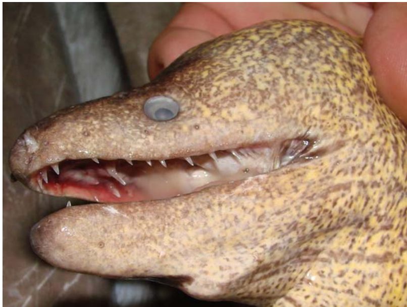
Figure 1. The largest and commonest moray eel in the Azores archipelago is Muraena helena . Note the sharp teeth, capable of to cause lacerations in the victim.

In this paper we report an unprovoked attack that caused a serious bite on the left hand of a free swimming spear fisherman.