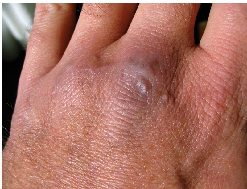
Figure 4. Total recovery of the wound after four months.