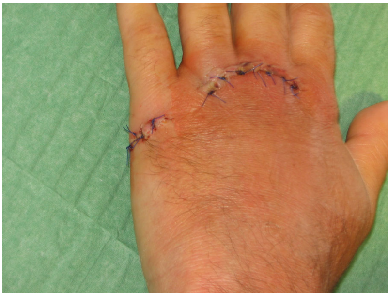
Figure 3. Evolution of the injury after ten days.