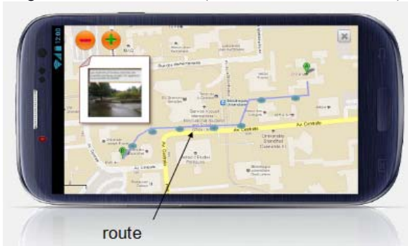
Figure 2 : Recitoire Mobile (Visualization of a Narrative)