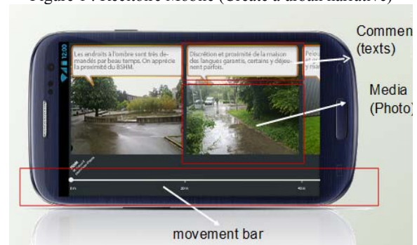
Figure 1 : Recitoire Mobile (Create a urban narrative)

comments appearing one after the other in the chronological order on the screen using horizontal scrolling. The idea is to provide a visualization of the whole urban narrative on the screen. To contribute, the citizen chooses the media she/he wants to create (photo, video, audio). After recording, she/he is invited to comment her/his contribution in an audio or textual way.