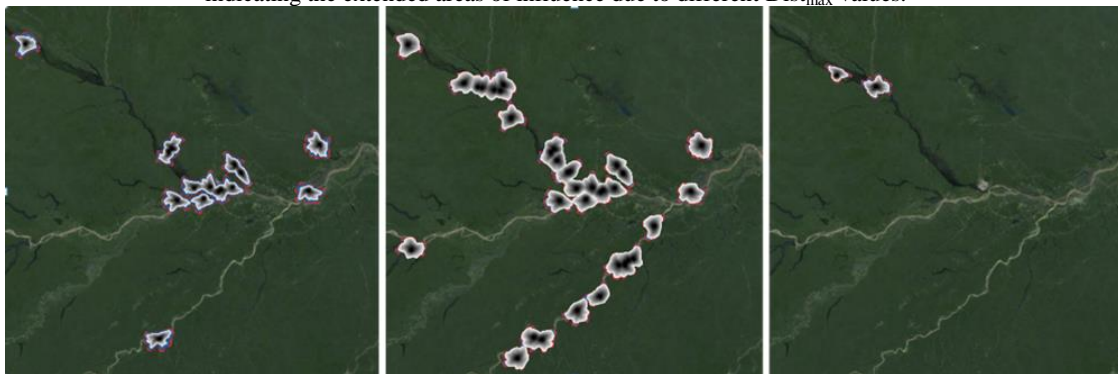
Figure 4: Results for the Guarita culture. Time intervals 1, 2 and 3 (from left to right). The red and blue colors are indicating the extended areas of influence due to different Dist_{max} values.

The quality of the resulting areas is highly dependent on the used cost surface. As [9] claimed, the data must be collected carefully to assure a more realistic model of the factors, which determine the area. That means, the final output is only as