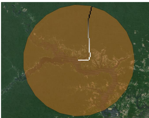
Figure 2: Calculating the least cost path – and therefore CD_{max} – for an excavation site and a predefined Dist_{max}

To factor spatial uncertainty a range of Dist_{max} values is defined. This is handled by the database in which predefined \alpha -values and associated extended Dist_{max} values are stored. The extended Dist_{max} values can be set independently for each finding, which allows individual treatment of each finding and therefore a higher accuracy for the findings which are well known. This is similar to the fuzzy spatiotemporal information system for handling excavation data introduced by [19].