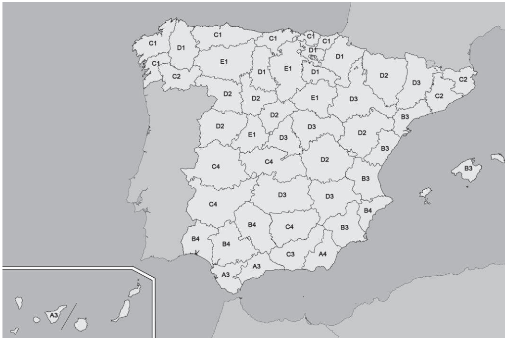
Figure 2. Distribution of the climatic zones, represented by the capital of the Spanish provinces.