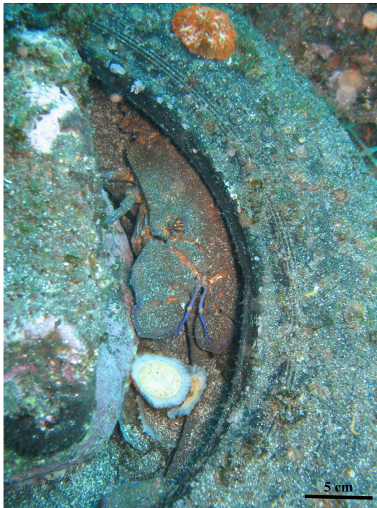
Fig. 2. Scyllarides latus inside its shelter (a used car tire, with one boulder inside) during feeding with limpets.

served as potential shelters inside the cage (Fig. 2). Lobsters were monitored and fed with fish and limpets about once a week, depending on weather conditions, over a period of nine months.