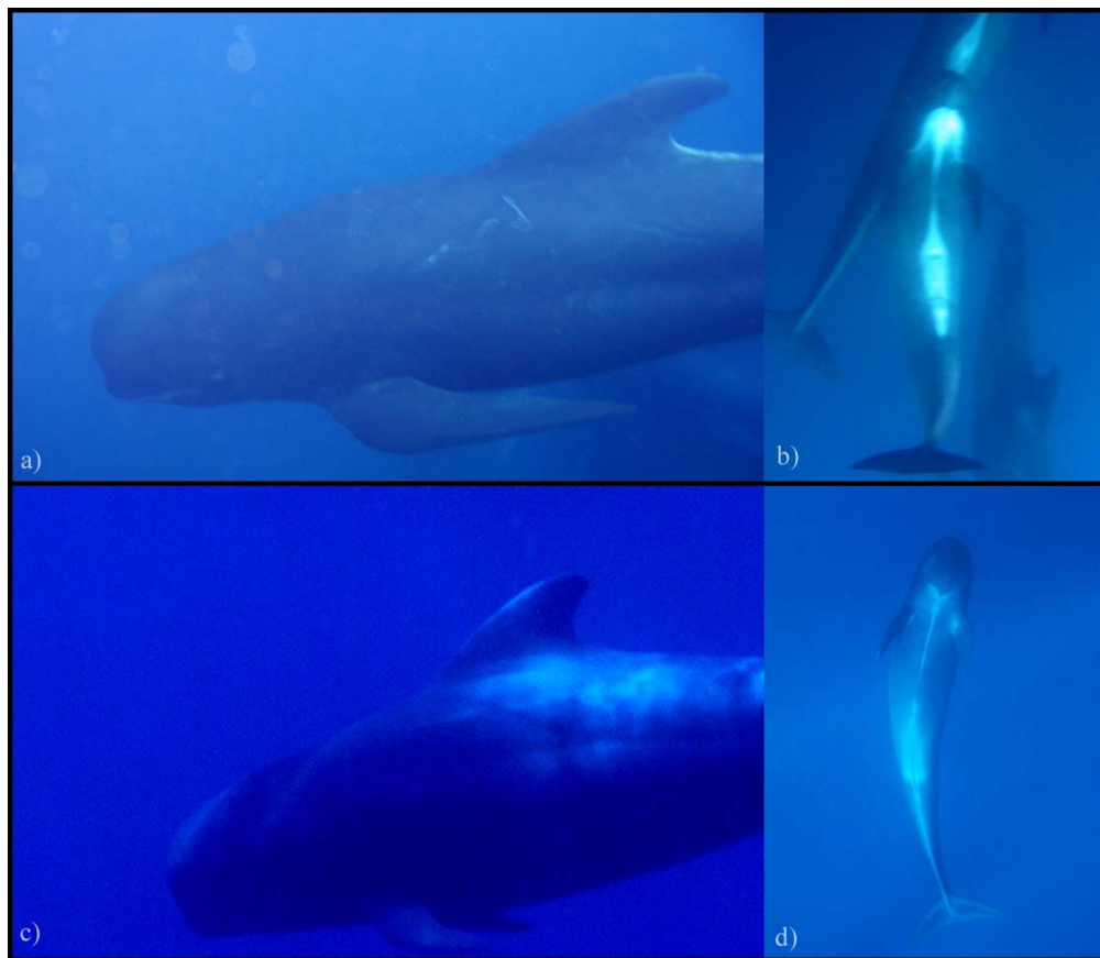
Fig. 2. Lateral (a) and ventral (b) views of Globicephala melas from sighting made 3 nautical miles south of Pico Island on 24 May 2003. Lateral (c) and ventral (d) views of G. macrorhynchus photographed in the Azores. Notice relative longer pectoral fins and brighter ventral pigmentation in G. melas , when compared with G. macrorhynchus .

The second sighting occurred in the morning on 05 of May 2006, at an approximate distance of five nautical miles off São Mateus, in the south coast of Pico island. The group comprised around 20 animals including adults and calves. The animals were socializing and several aerial displays were observed. The group approached the boat several times, allowing close inspection of the pectoral fins and ventral pigmentation. This sighting also lasted around 20 minutes.