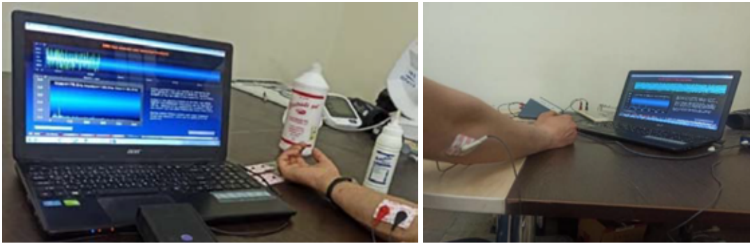
Figure 4. Sites of electrode placement on FDS muscle and reference electrode.

the mean difference in different exposure scenarios. Pearson's correlation was used to determine the association between EMG parameters and mental fatigue. A p-value less than 0.05 was statistically established as the limit for statistical significance.