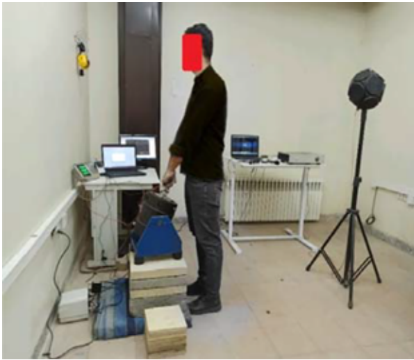
Figure 1. Experimental setup for simulating exposure to HTV and/or noise.

hand postures as the fixed main biodynamic factor corresponded to the observed real workstation during the destruction of building floors in all exposure scenarios, as shown in Figure 1.