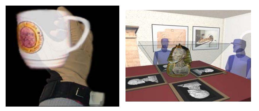
Figure 1: An occlusion example (left); the planar reflection of Virtual Showcases (right)

This phenomenon can be described as follows: when interacting with the augmented environment, the user's hand and other real objects can hide the projected image, thus making it impossible to have a virtual object closer than the hand. One potential solution for the problem is to project the image between the eyes of the viewer and the real objects in order to avoid the occlusion problem. For better understanding this, we can imagine two of the following situations that may occur: in the first one the hand or arm of the user is always on front of virtual object, while in the second one, they are always behind of virtual object (see Figure 1). In both cases the user loses eye contact, thus information, with part of the AR scene (virtual or real).