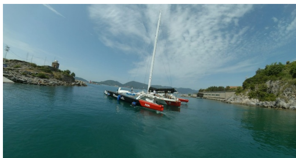
Fig. 5 - Trimaran Maserati Multi70 approaching the pier in S. Teresa Bay.

In addition to the factory calibration, periodically and before each use, the probe is checked at ENEA by measuring a mixture of known CO 2 concentration, flushed in air at ambient pressure for about half an hour. During the last metrological check, a mixture with a CO 2 concentration value of (447.8 \pm 2.2) ppm was used; the mean concentration measured by the probe was equal to (445.5 \pm 6.2) ppm, where the reported standard uncertainty was calculated by combining the contributions of the declared accuracy term and the measured repeatability, respectively. As a result, the metrological check was found to be reasonably verified. As an example of use in the field, as part of the Smart Bay Santa Teresa activities, the CO 2 -Pro CV probe was employed to perform a preliminary metrological check of the OceanPack-RACE measurement system, at the time just mounted on the trimaran Maserati Multi70 (see paragraph IV). The opportunity to carry out this verification took place on 27 May 2022, just before the first campaign of the OceanPack-RACE ; the CO 2 -Pro CV was deployed at the pier in the bay of S. Teresa, at a depth of 1 m and about 10 m far from the OceanPack-RACE probe mounted on the trimaran. In Fig. 5 the trimaran Maserati Multi70 is shown.