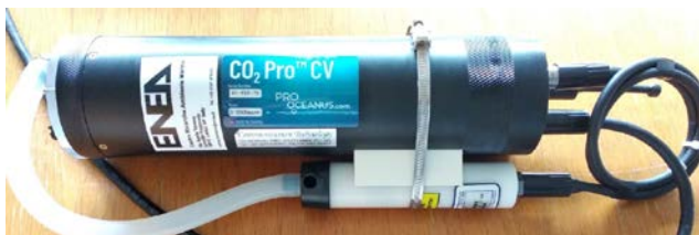
Fig. 4 - CO 2 -Pro CV probe on bench.

The probe has the following characteristics: