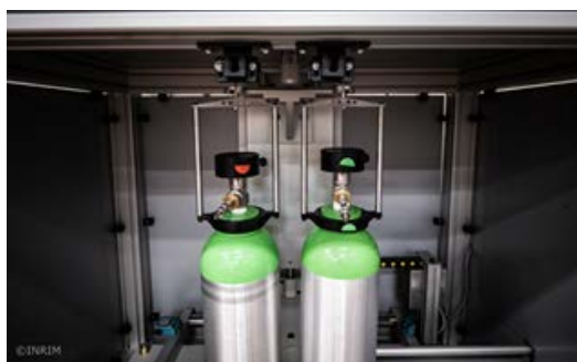
Fig. 3 - Detail of the mass comparator used at INRiM for the gravimetric preparation of reference gas mixtures.

The CRMs are produced by means of a primary method, the gravimetry, and this procedure is defined in [13]. The gravimetric method consists in the preparation of binary or multicomponent gas mixtures, by weighing and mixing known masses of gases, and to determine the amount fraction of the components in the final mixture on the basis of these masses, determined by a high precision weighing. This step is carried out by using a mass comparator, which allows the weighing of the cylinder in preparation with respect to a reference cylinder, thus obtaining very low preparation uncertainties.