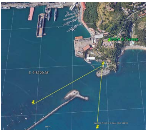
Fig. 2 - Detail of the three WSense acoustically intercommunicating monitoring nodes, positioned close to S. Teresa bay. The green marker indicates the position of the ENEA Institute.