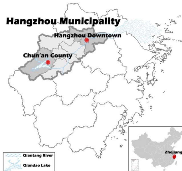
Figure 1. The locations of Chun'an county and Hangzhou in Zhejiang Province, China.

Chun'an is a peripheral county under Hangzhou's jurisdiction. It is Zhejiang province's largest county by size, covering 4,427 km 2 . Notably, Chun'an houses Qiandao Lake, spanning 573 km 2 , formed as an artificial reservoir after the completion of China's first indigenously designed hydroelectric station—Xin'an River Station—in 1959. Qiandao Lake became a tourism destination during the 1980s. In the 1990s, Chun'an embarked on a path of industrialization, capitalizing on its water resources to attract manufacturing industries like steel, chemicals, coking, and papermaking. This endeavor, however, contaminated Qiandao Lake and Qiantang River, which also traverses Hangzhou (Figure 1). Consequently, since the 2010s, Hangzhou has urged Chun'an to enhance environmental protection by carrying out the enforcement of an act of de-industrialization. This enforcement has pushed nearly all contaminative sectors and factories out of Chun'an (Chun'an County Government, 2022).