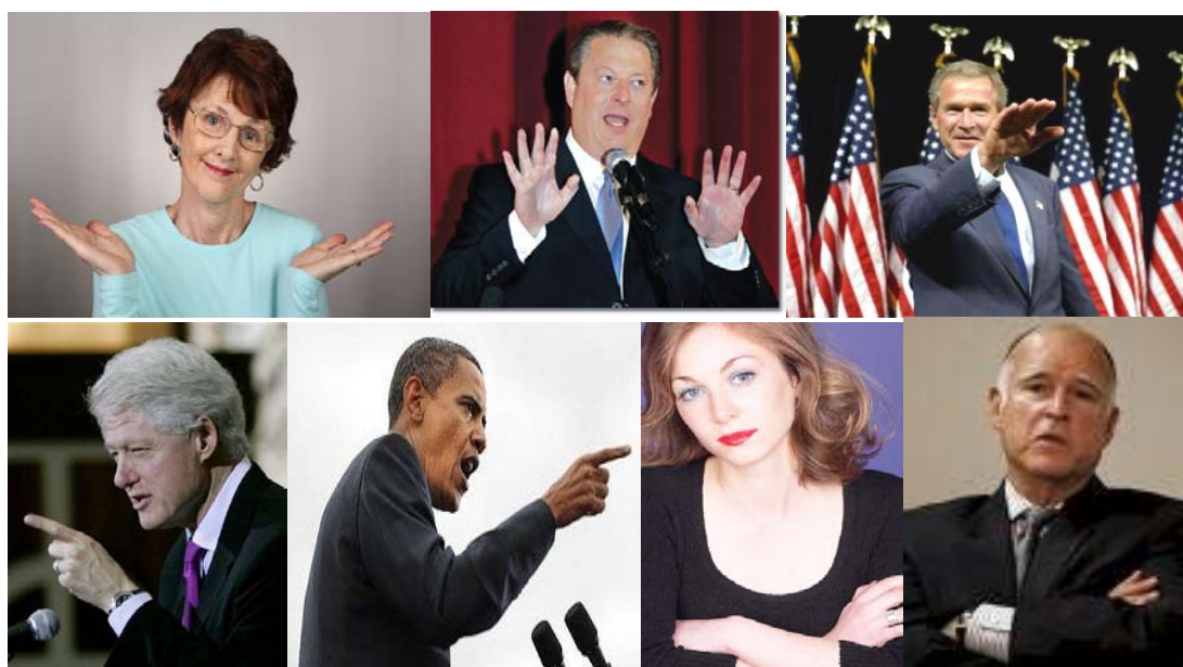
Figure 3. Examples of pictures used to illustrate body language.

well-known figures from the world of politics were also used to exemplify how body language is associated, sometimes unconsciously, with a person's position or personality (Figure 3). The notions taught to the students were then discussed in all the videos watched in the course, and the students were encouraged to try to monitor their own gestures and gaze, and to use them appropriately as a means of emphasizing, and directing attention to the important parts of their speeches.