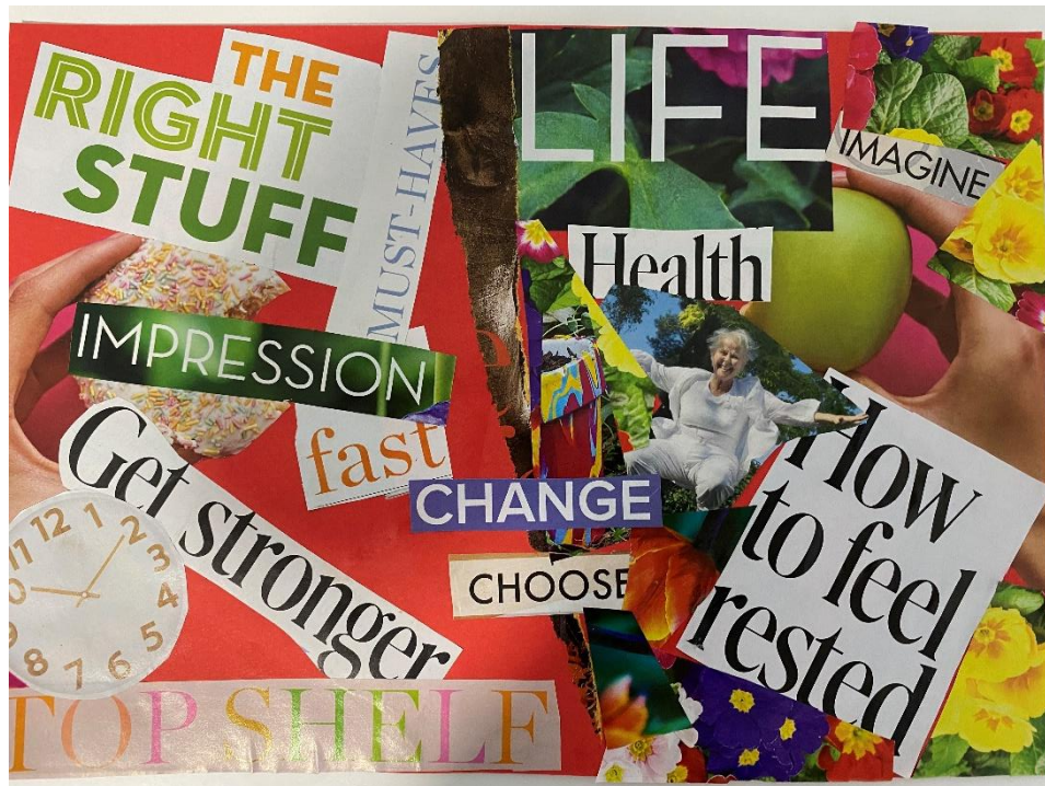
Figure 4: Voice 4