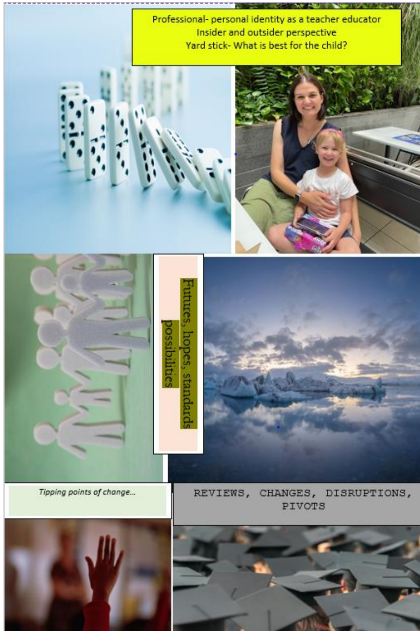
Figure 2: Voice 2