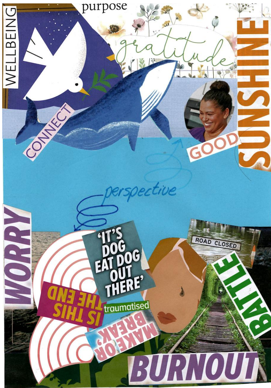
Figure 3: Voice 3