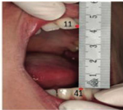
Measured distance is 42 mm