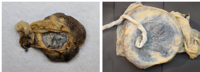
Fig. 2. Macroscopy of circumvallate placenta with an abnormal membrane insertion with a raised edge and fibrin (left). Placenta circummarginatum (right) with without a raised edge and folding of the membranes.

acute chorioamnionitis are significantly associated in preterm birth with an estimation that equals 16.59 with 95 % CI between 12.85 and 20.97 for the population ratio. Chi-Square p < 0.001 (Supplementary Table 1). The combination of all three abnormalities (circumvallate placenta, placental abruption and acute chorioamnionitis) was not found in term pregnancies (Table 2). Placentas in our cohort were in general lower in weight (below P50) in all groups (Table 2).