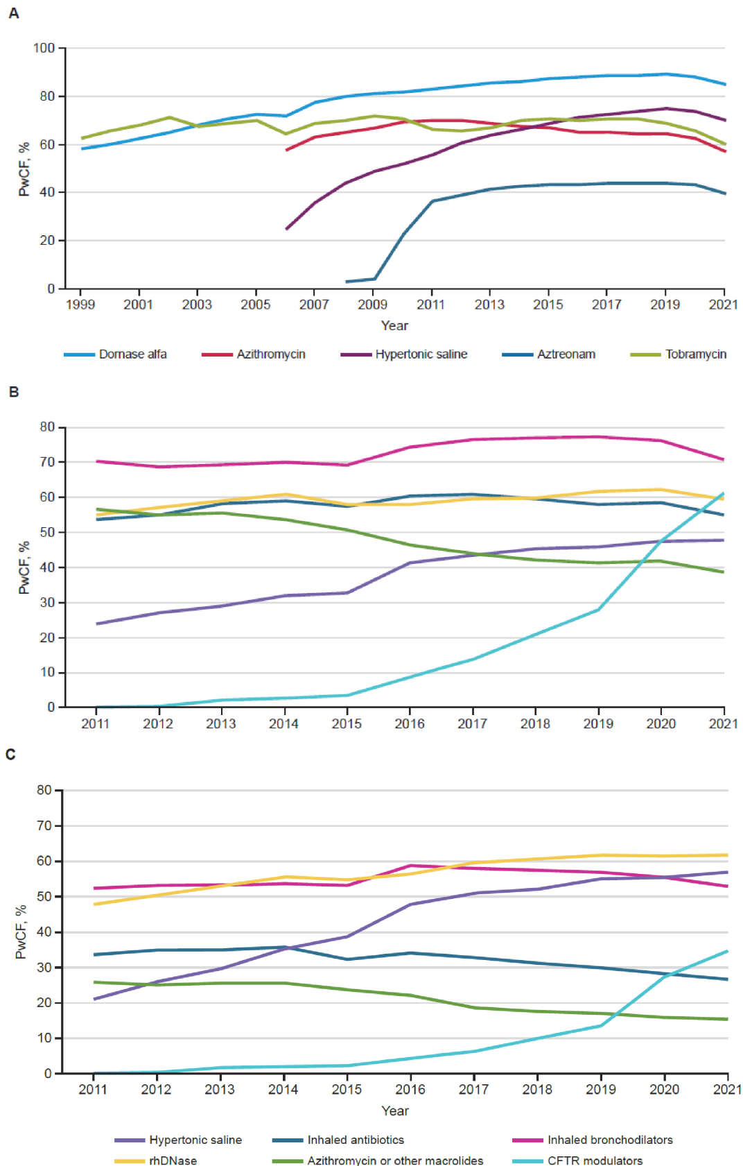
Figure 2 Medication prescriptions in (A) eligible pwCF from 1999 to 2021 in the USA 9 ; (B) adult pwCF from 2011 to 2021 in Europe 8 and (C) children with CF from 2011 to 2021 in Europe. 8 Reproduced with permission: (A) Cystic Fibrosis Foundation Patient Registry. 2021 Annual Data Report. Bethesda, Maryland copyright 2022 Cystic Fibrosis Foundation 9 and (B) and (C) ECFSPR Annual Report 2021, Zolin A, Orenti A, Jung A, van Rens J, et al , 2023. 8 CF, cystic fibrosis; CFTR, CF transmembrane conductance regulator; pwCF, people with CF; rhDNase, recombinant human deoxyribonuclease.