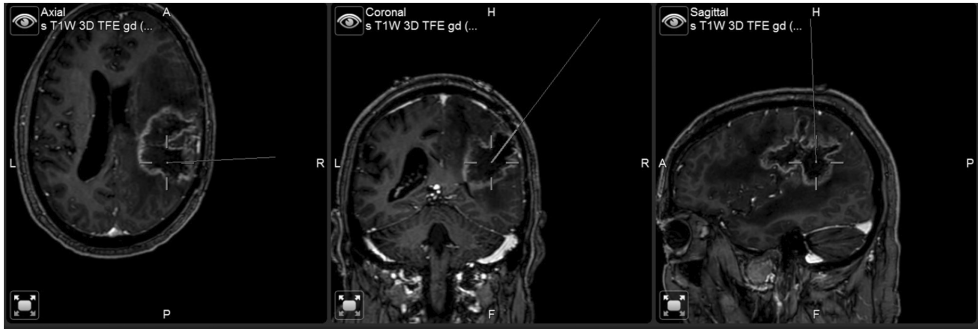
FIGURE 2 Electrical stimulation of the right inferior parietal lobe that resulted in making mistakes performing a left-right discrimination test.