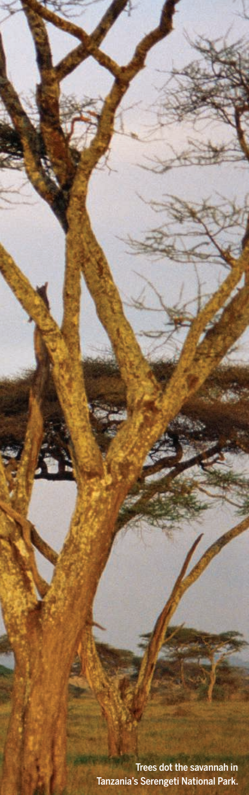
Trees dot the savannah in Tanzania's Serengeti National Park.

finding that tree planting is widespread across nonforest systems.