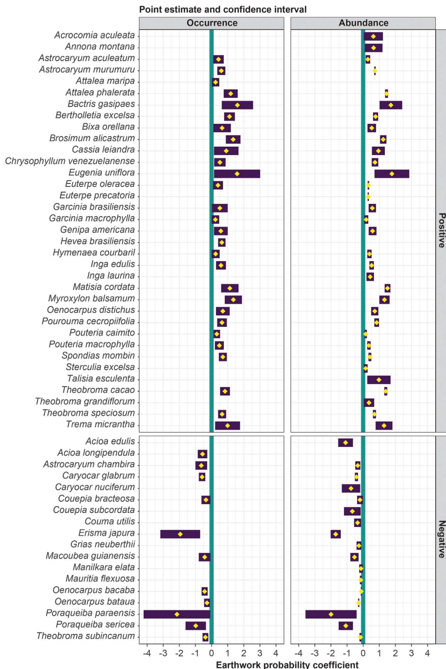
Fig. 3. Significant relationships between the occurrence and abundance of domesticated tree species and the modeled distribution of earthworks in Amazonia. Point estimates and confidence intervals of species significantly associated with predicted probability of earthwork presence, with an overall significance level of 5%. Positive species are more likely to occur and be abundant where predicted probability of earthwork presence is high, whereas negative species are less likely to occur and be abundant there.

covariates were used to describe the dataset sample preference by indicating the most favorable location for sample acquisition (32). The effect of sample selection bias was individually weighted for each sample (21).