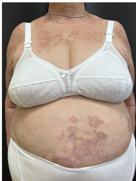
Fig 1. Patient at baseline: granuloma annulare on the trunk and upper limbs.

Morphological similarities to other forms of granuloma suggest that GA is caused by a Th1 inflammatory reaction, leading to the use of drugs that inhibit this Th1 activation, such as tumor necrosis factor-alpha inhibitors. 4 Despite best efforts, therapy often fails, suggesting that an alternative pathway may be involved in the development of GA, as in the case presented. The response to Th1 or Th2 inhibition may depend on the stage of granuloma formation. 1 In a case with a