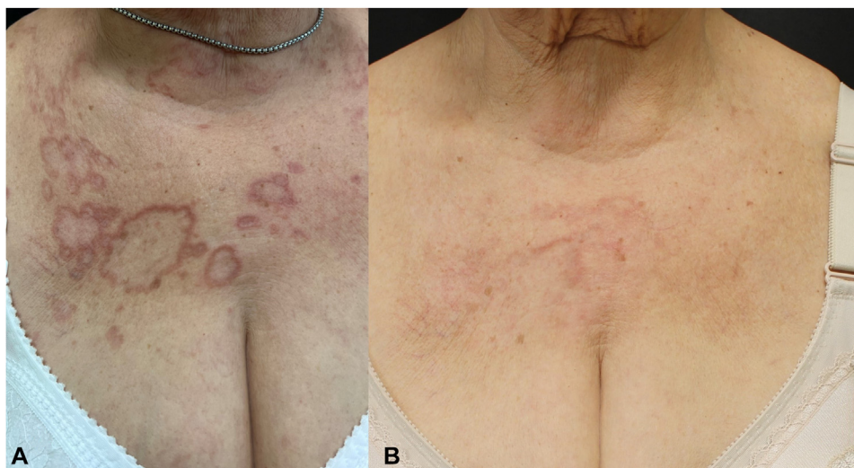
Fig 3. A , A particular of upper chest at baseline. B , A particular of upper chest after 24 weeks of dupilumab.