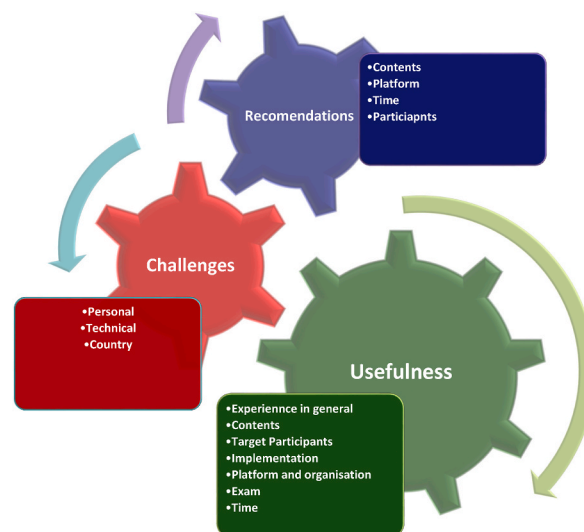
Fig. 1. Themes emerged and framework.

This study included 10 dentists who completed the TDIs course and participated in this study. The demographic data has indicated that the sample consisted of five males and five females. About five participants were between 25 and 30 years old, four participants were between 30 and 35 years old, and one was over 45 years old. Eight participants graduated from public universities, and two