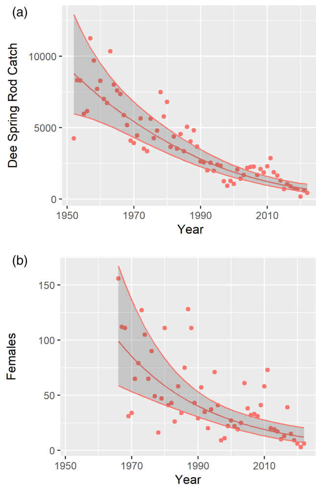
FIGURE 1 (a) Declining Atlantic salmon angling catches on the Aberdeenshire River Dee, Scotland: Many salmon rivers in Europe and North America show similar declines. (Note spring fish are those that are caught between February and May which mainly spawn in mountain headwater areas). (b) Similar decline in numbers of returning adult female salmon returning to a monitoring site on the Girnock Burn, a tributary of the Aberdeenshire Dee (After Soulsby et al., 2024).

river restoration schemes. This comes at a time when substantial public funds are becoming available for restoration work aimed at addressing the climate and biodiversity crises. Unfortunately, as the main issues of salmon decline are marine in origin, improving freshwater habitat in most salmon rivers is likely to have only marginal, if any, impact on declining numbers of returning fish. However, given the growing concern over salmon declines, fishery managers are often under pressure from proprietors and anglers to “do something”. Moreover, frustration at the limited options for addressing the marine origins of salmon declines sometimes force managers into “displacement activity” in areas where they can act. Consequently, a number of increasingly ambitious landscape-scale restoration projects are already being implemented through government funding including salmon-focused schemes in several relatively large river basins.