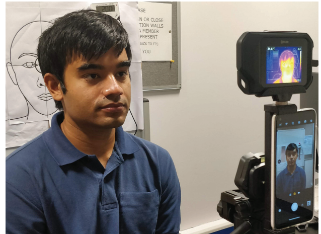
Fig 1. The FLIR C3 IR camera workstation with participant alignment, digital photography and IR thermography. IR = infrared.

First, IR and digital photos were taken using a FLIR C3 thermal camera and a Moto G8 smartphone. The tripod-mounted IR camera was positioned 0.6 m from the participant's face and the participants were positioned to align their head with a reference frame to maintain image ratios (Fig 1). One IR image was taken of