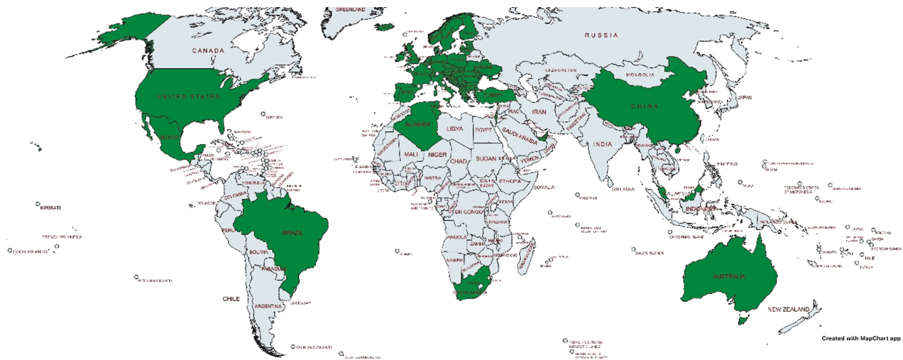
Figure 1. The COST Action LeverAge network: a snapshot in time. Countries currently in the COST Action LeverAge network are highlighted.

workplace in WOP and HRM/OB, and by taking into consideration emerging practical issues in global workplace trends. Specifically, these topics were identified considering the existing and emerging research developed and presented at the Age in the Workplace Meeting (AWM) in 2019. The AWM is a conference series on age in the workplace (running every 2 years since 2011) that brings together the main experts from around the world to share research findings and develop a research agenda to address the aging workforce (e.g., https://www.rug.nl/gmw/psychology/awm2021/ ). Based on this analysis of research presented at the AWM, we identified five broad research directions for work and aging science, as detailed below. Figure 2 depicts these research directions, which we then used to organize the COST Action structure into five topic-specific Working Groups.