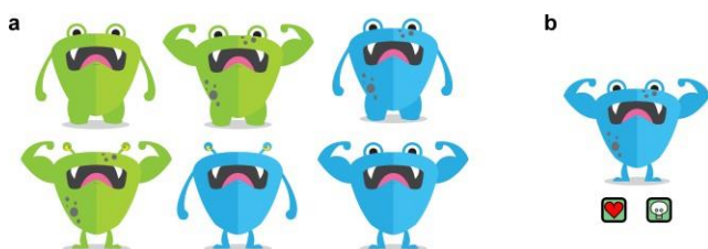
Figure 1: a: Stimulus examples. b: A token alien with button options as presented in a trial

In all parts of the experiment, participants solved the same reinforcement leaning task. They were presented with depictions of extraterrestrial aliens and had to categorize them as friendly or dangerous. The stimulus set consisted of digital images of 32 different aliens that differed on five binary features: color green or blue, arms up or down, eyes on stalks or not, legs slim or fat, spots or no spots (see figure 1a for examples). Each trial of the experiment presented a token alien and two buttons depicting a heart and a skull (see figure 1b). Participants were instructed to make a choice to save friendly aliens (by clicking the heart) and kill dangerous aliens (by clicking the skull). After each trial, they received feedback about the correctness of their choice and a running score that added a hundred points for correct decisions and subtracted hundred points for wrong decisions (with a lower bound of 0 points).