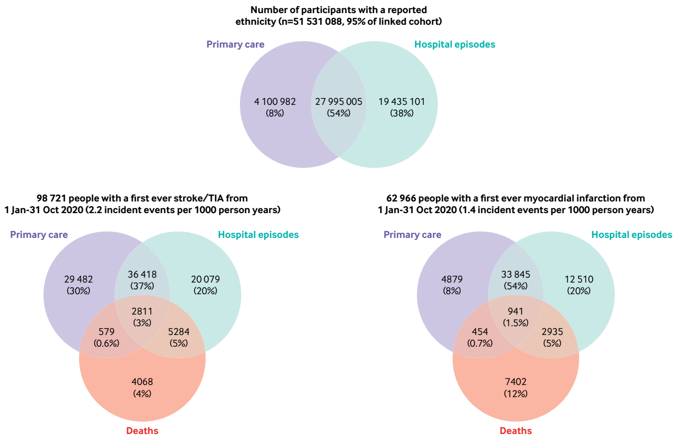
Fig 2 | Data sources reporting person level data on ethnicity, incident stroke or transient ischaemic attack (TIA), and incident myocardial infarction

with covid-19 on the death certificate, 35 the data from our linked cohort concurs with those from relevant cumulative counts of people with covid-19 (supplementary table 8).