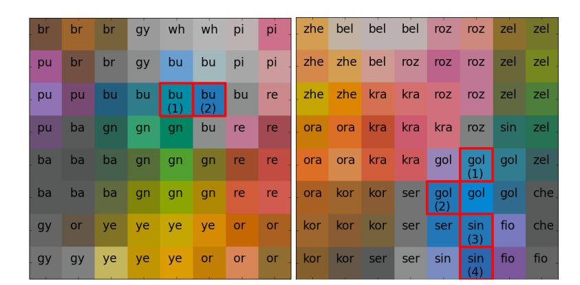
(b) Converged maps for English (left) and Russian (right). S_{\text{disc}} stimuli are mapped to the highlighted cells. Cell labels are taken from the first few letters of the most likely term for the cell. bu= blue ; gol= goluboj , sin= sinij .